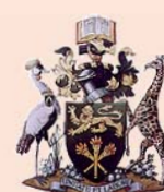
University of Nairobi